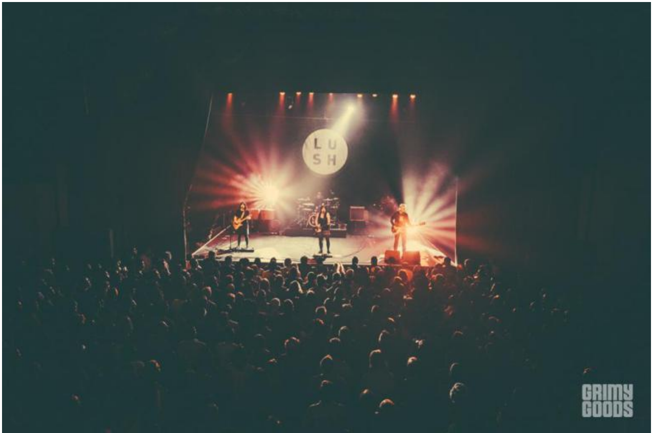
Lush at Fonda Theatre, Hollywood