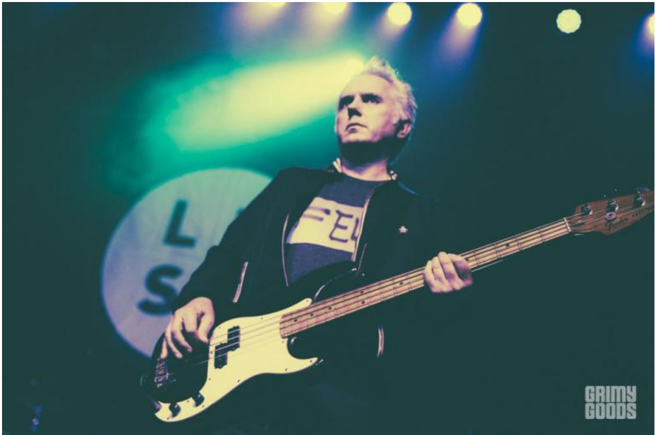
Lush at Fonda Theatre, Hollywood