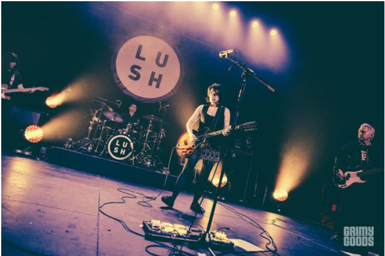
Lush at Fonda Theatre, Hollywood