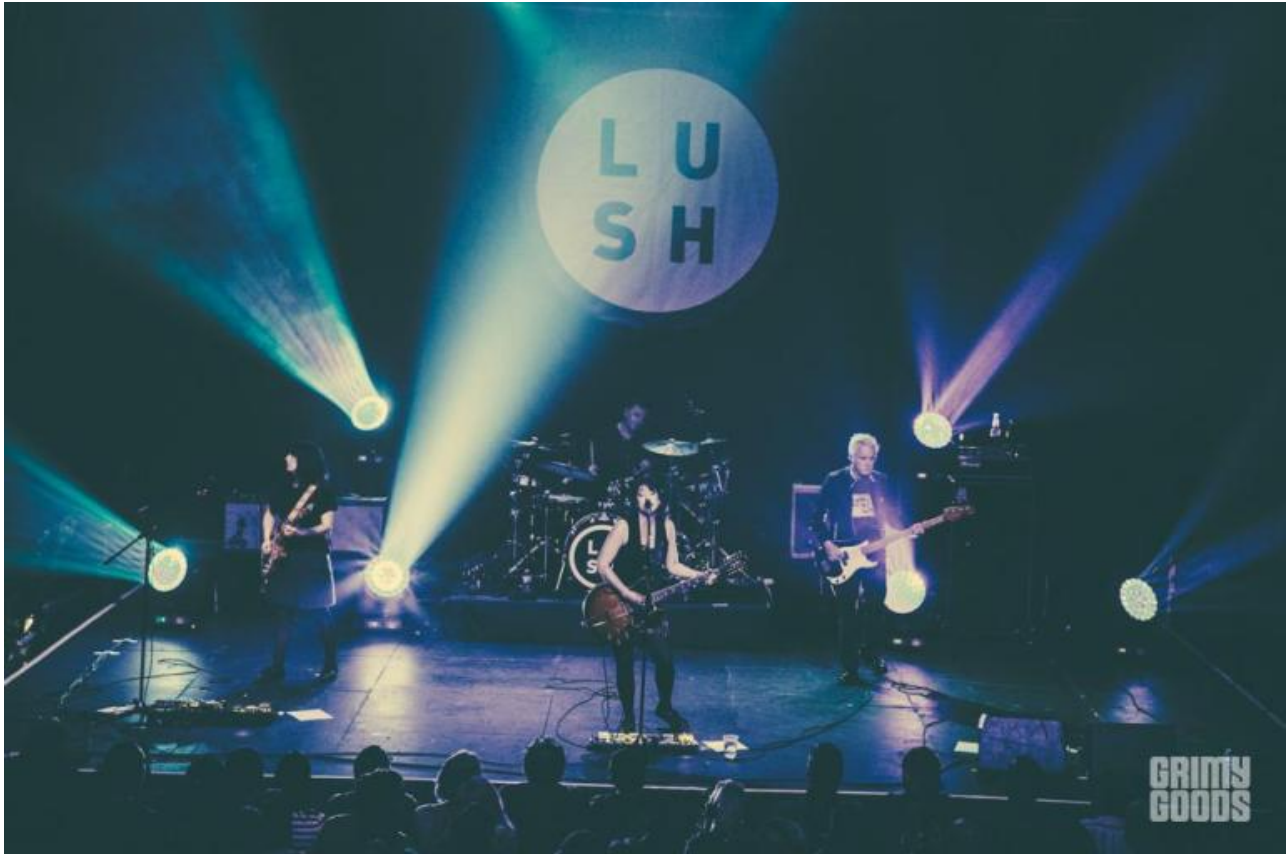
Lush at Fonda Theatre, Hollywood

Shoegaze pioneers, Lush played a nostalgic set for long time fans at the Fonda Theatre in Hollywood this past Saturday night. It was magical seeing these legends take the stage and perform in a new era; an era in which so many modern acts have taken some serious cues from Lush.